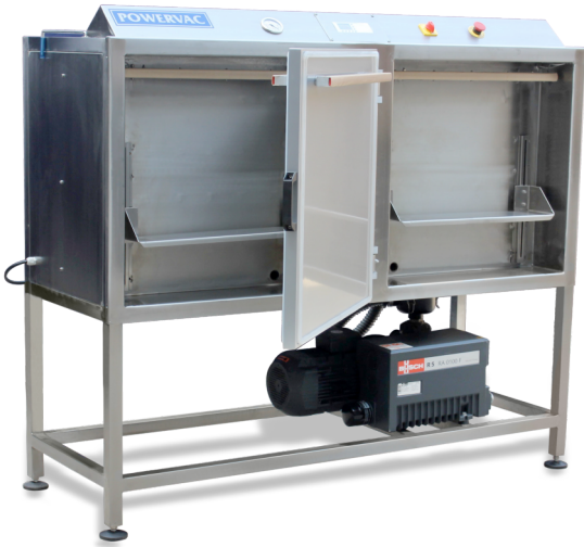
Seal Bar Position