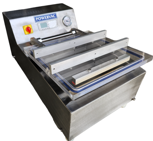
Seal Bar Postion